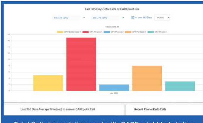
Total Calls by each line used with CAREpoint Workstation