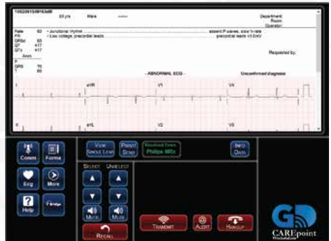
12-Lead Management Screen

No more life-saving decisions without 12-Lead verification. That's right! GD CAREpoint™ is an FDA listed, HIPAA compliant device that receives 12-Lead from multiple monitors. Not receiving 12-Lead leaves too much room for error causing hospitals to lose money with false lab activations; send 12-Lead data, send photos or faxes of 12-Lead.