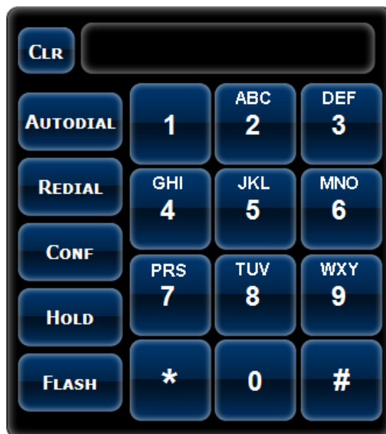
(Blue, on screen keypad)